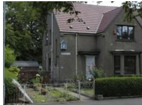
The house where sisters live

The terrified Indian nuns, who work with the charity founded by Mother Teresa, said the noise was so loud it sounded like there had been an explosion in the house.